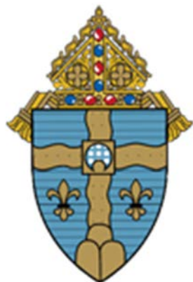
Diocese of Joliet